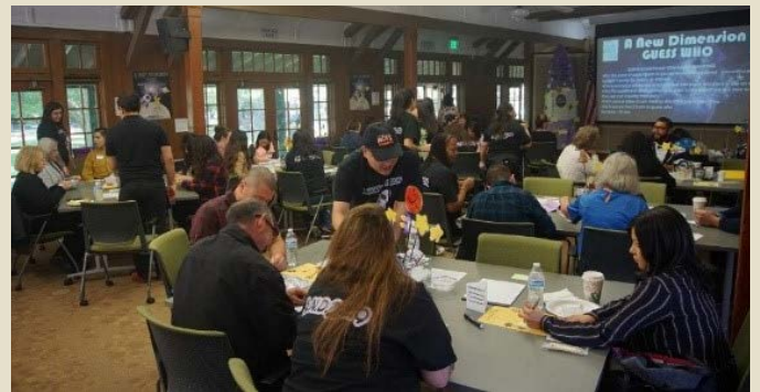
Pictured: CFS clerical staff participating in an activity at the offsite appreciation event

For the past four years, the Children & Family Services (CFS) Operational Support Services team has planned and facilitated an annual offsite event for clerical support staff geared towards team building, developmental training, networking, recognition and appreciation. The two-day event, known as "A New Dimension" (or "A.N.D."), emphasizes and recognizes the contributions of clerical support staff. The planning of the event creates an opportunity for line staff to participate in subcommittees to develop project management skills. This experience allows them to build their leadership and communication skills, partner with their peers and build their confidence.