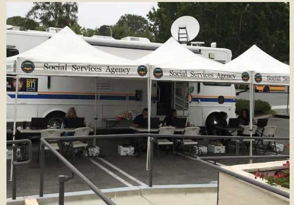
Pictured: SSA staff on standby at the MRV to provide assistance to potential applicants in Laguna Woods

Collaboration and cooperation was the sentiment of the day. As the weather grew warmer, Centralized Operations quickly came to the rescue by bringing additional canopies for shade. Information Technology (IT) staff were also present the majority of the day, assisting eligibility staff with computer/printer set-up and being on standby just in case any technical issues arose. Through collaboration with IT, SSA was able to successfully issue 16 Electronic Benefit Transfer (EBT) cards directly from the MRV that same day!