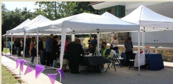
Pictured: Staff visiting and receiving information from various booths at the event's employee resource fair

This year, the A.N.D. event included a presentation by Human Resource Services (HRS) Learning & Organizational Development on "Growth