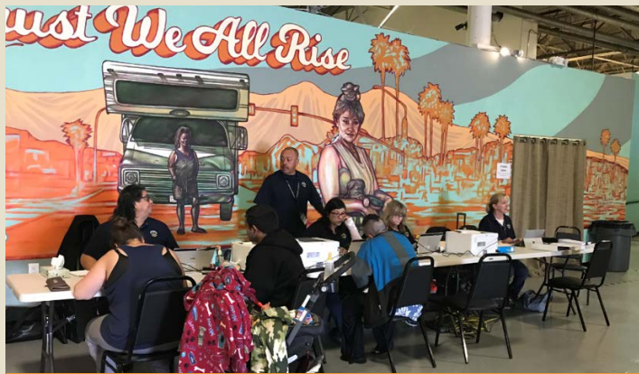
Pictured: SSA staff providing assistance to clients at The Link shelter

As part of SSA's commitment to providing services where the need is throughout the county, the Assistance Programs (AP) Outreach Team was asked to provide services at the new Link shelter in Santa Ana. The Link is a 24-hour emergency homeless facility that serves homeless men, women, families with minor-age children and homeless couples. For SSA, this operation was a first of its kind—all of our previous outreach efforts have been to shelters that serve single adults only and generally fall under the auspices of the AP Division. Because The Link also serves families, the AP Outreach Team would partner with the Family Self-Sufficiency & Adult Services (FSS & AS) Division to also deploy to this facility.