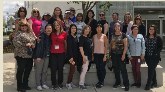
Pictured: SSA participants in this month's Wellness Walk at the Laguna Hills Regional Center

Walking is the simplest and easiest activity to incorporate self-care in the workplace. That being said, start with small goals and encourage one another to go outside and walk. Invest in yourself; you will not regret it!