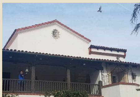
Pictured: A dove is released in memory of a child