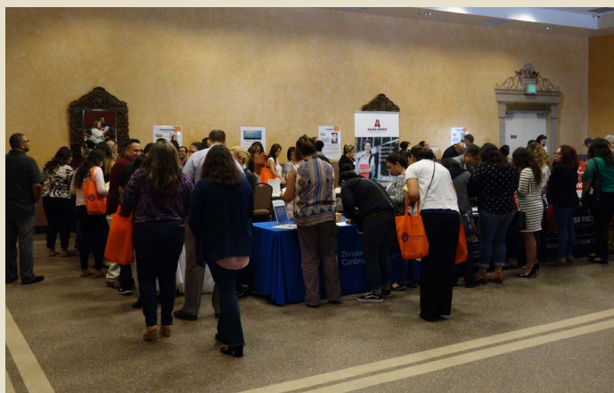
Pictured: SSA staff attending the Educational Resource Fair