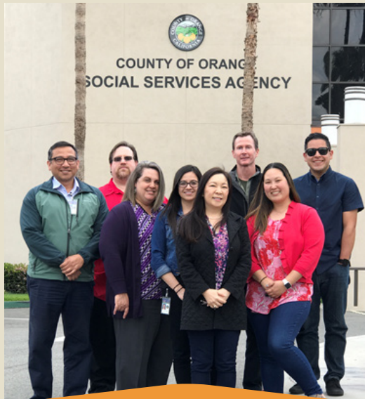
Pictured: CWS/CMS Data Cleanup Workgroup (Not all members are pictured).

SSA's Children and Family Services division (CFS) is preparing for the new statewide child welfare system which will be officially named "CWS-CARES". CWS-CARES is an acronym for: Child Welfare Services - California Automated Response and Engagement System, or simply referred to as CARES. Eight digital services such as Intake, CALS (Certification, Approval, and Licensing Service), Case Management, and Eligibility, will combine user-centered design and a reliable customer experience into a web-based application. CARES is one of the first statewide projects to embrace a collaborative approach to software development and implementation.