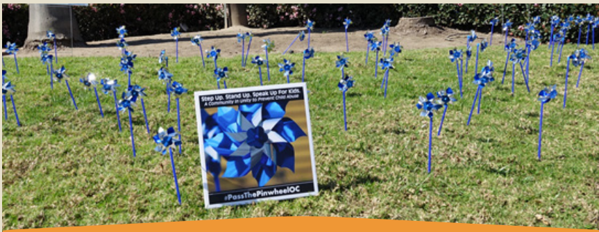
Pictured: The pinwheel garden in front of Bowers Museum in Santa Ana.

As social workers, providers, and social services professionals, we work to support children and families because we deeply believe that every child should have