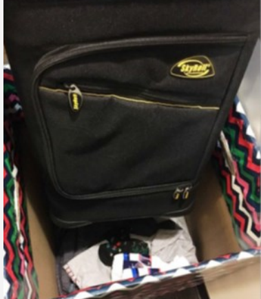
County's most vulnerable residents. Your donations and contributions are Pictured: One of the suitcases appreciated! Thanks again!

demonstrate their compassion and care for Orange