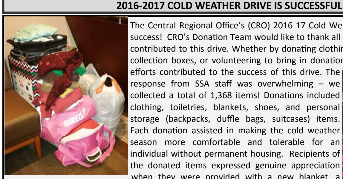
Pictured: One of the donation boxes overflowing with items

Bottom photo: A view of Phase I of Bridges at Kraemer Place