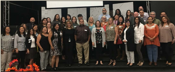
Pictured: CFS social workers, supervisors and parent mentor volunteers involved in the success of the honored families